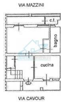
PIANO TERRA H=3.20